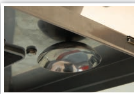
Convenient Snow Cone Shaper