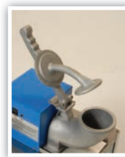
Cast Aluminum Assembly