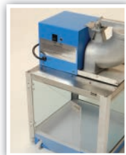
Polycarbonate Service Door