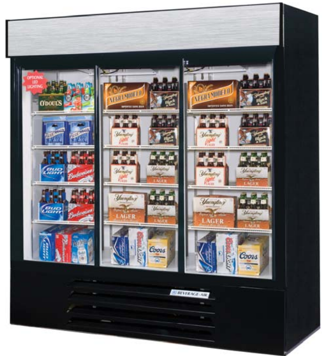
LV66Y-1-B (shown with 4 shelves per section)

MODEL: LV66Y-1-B LV66Y-1-W LV66Y-1-B-LED LV66Y-1-W-LED