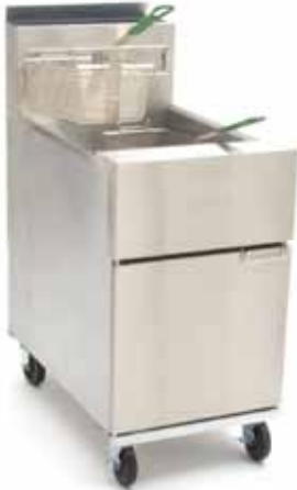
SR62G Shown with optional casters.