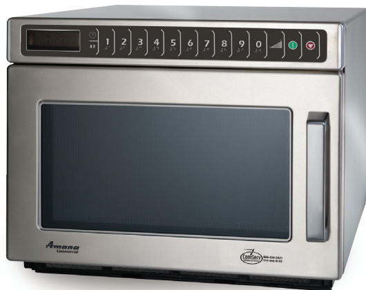
Model HDC182 shown