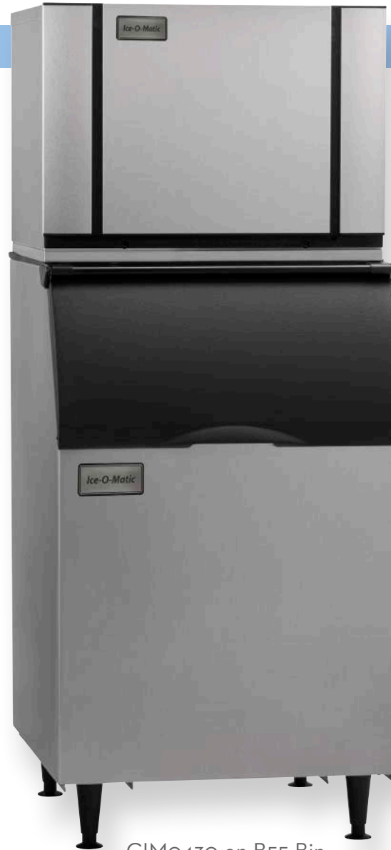
CIMo430 on B55 Bin

No bottle brushes required. Easily removed and disassembled for cleaning. Dishwasher safe.