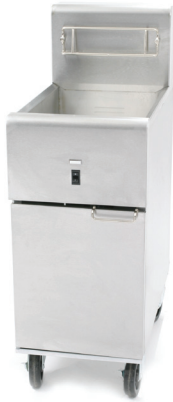
SR14E Shown with optional casters.