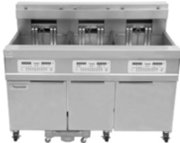
Model Shown: 11814E/RE17/11814E