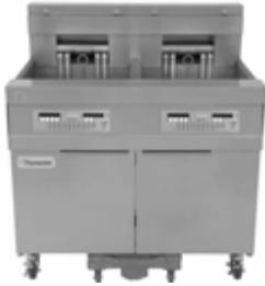
Model Shown: 21814E with optional filtration