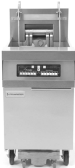
FPRE180 Shown with optional CM3.5 controller and basket lifts