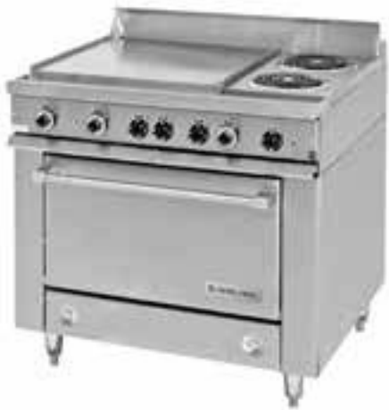
Model 36ER32-3 Combination All Purpose Plate And Open Element Top Range