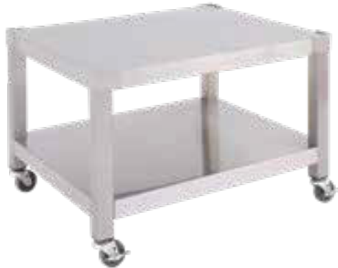
A4528796 Stand for 24" counter models with caster feature