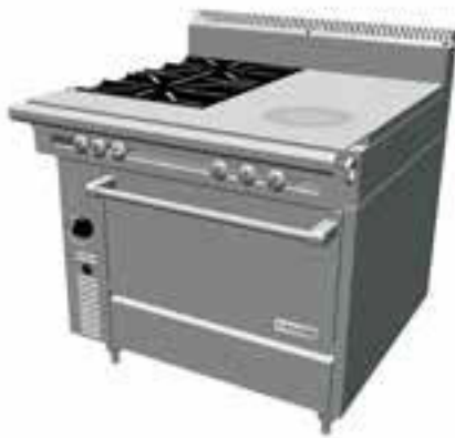
Model C836-17R Range with 2 Open burners & 18" Front Fired Hot Top