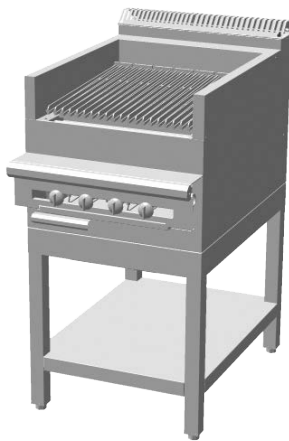
Model C0836-24AM (shown with optional legs & shelf)