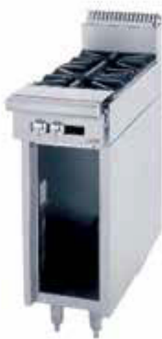
Model C1836-7 18" Add-A-Units, Griddle, Open Burners, Hot Top and Front Fired Hot Top