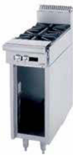
Model C1836-7 18" Add-A-Units, Griddle, Open Burners, Hot Top and Front Fired Hot Top