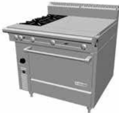
Model C836-12 Range with 2 Open Burners and 12" Even Heat Hot Tops