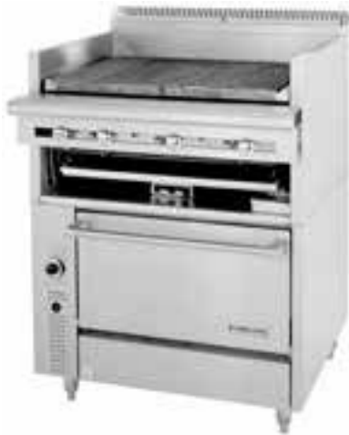
Model C836-436A Char-Broiler With Adjustable Racks – Briquettes Or Radiants