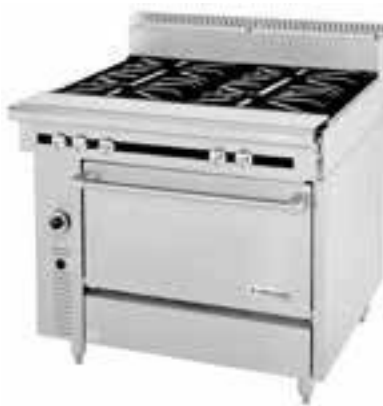
Model C836-7 Range with Four Open Burners