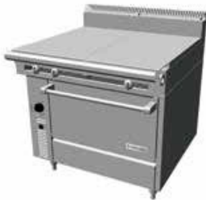
Model C836-9 Range with Two 18" Even Heat Hot Tops