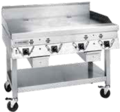
Model CG-48R (shown w/optional stand & casters)