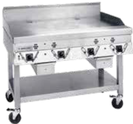
Model ECG-48R (Shown on optional stand)