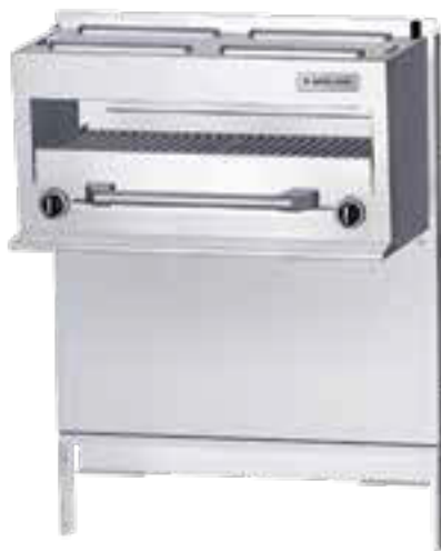
Model GFIR36M Infra-Red Broilers With Pull Out Broiling Rack