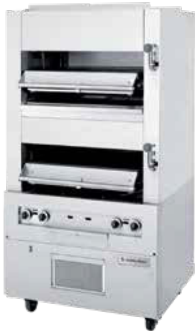
Model M110XM, (shown with optional casters & stainless steel sides) Infra Red Double Broiler