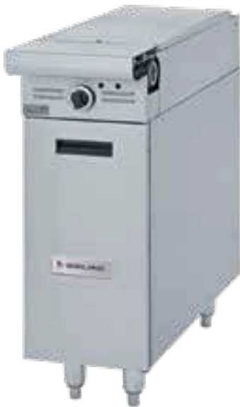
Model M12S-6 12" Range Attachment With Even Heat Hot Top