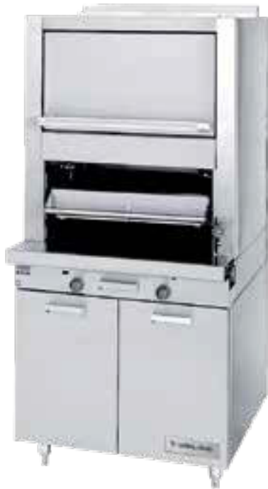
Model M60XS Ceramic Broiler with Upper Finishing oven