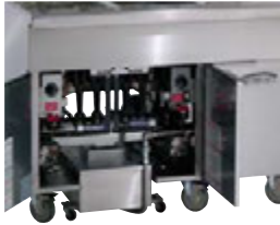
Filter is located under fryers to save valuable space.