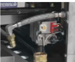
5.5 GPM, 1/3 HP roller pump speeds up filtering process.