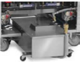
Filter pan is designed for maximum oil return.