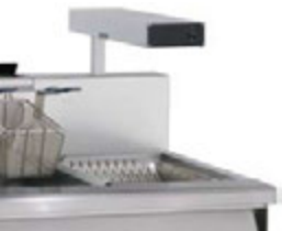
Side Car includes a stainless steel cabinet with a drain area, food warmer and dump pan.