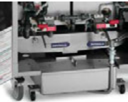
Filter pan is designed for maximum oil return.