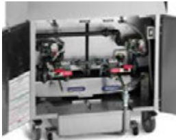
Filter is located under fryers to save valuable space.