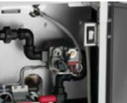
5.5 GPM, 1/3 HP roller pump speeds up filtering process.