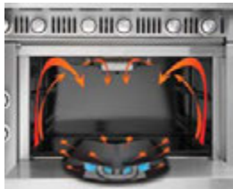
"M" shaped burner for even heating throughout the oven cavity.