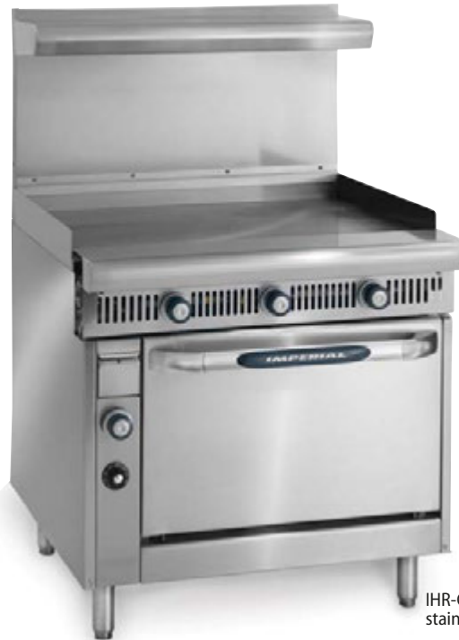
IHR-G36 shown with optional stainless steel backguard and shelf