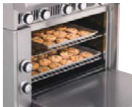
Accommodate sheet pans front-to-back and side-to-side.