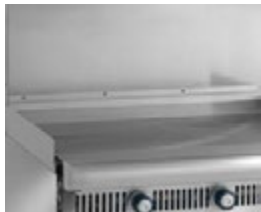
1" (25 mm) thick steel polished griddle plate.