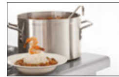
LARGE 5" (127 MM) STAINLESS STEEL LANDING LEDGE FOR CONVENIENT PLATING.