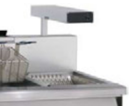
Side Car includes a stainless steel cabinet with a drain area, food warmer and dump pan.