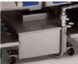
Filter pan is designed for maximum oil return.