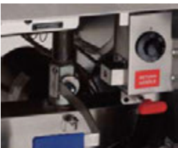
5.5 GPM, 1/3 HP roller pump speeds up filtering process.