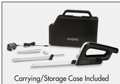
Carrying/Storage Case Included