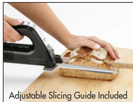
Adjustable Slicing Guide Included