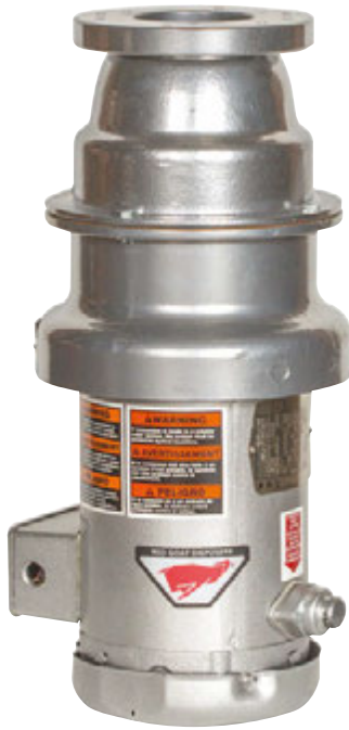
"F" Series Basic Disposer