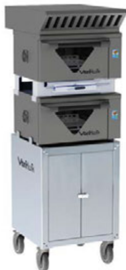
VK-VH Hood, 2 VK ovens, VK-SK Stacking Kit, VK-OS1 Oven Cabinet