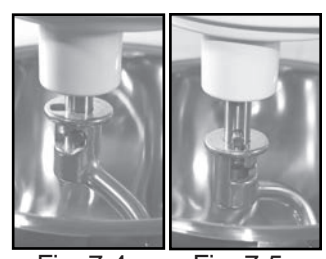
Fig. 7-4 Fig. 7-5