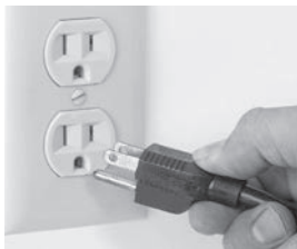
Fig. 6-1 Correct

THIS MACHINE IS PROVIDED WITH A THREE-PRONG GROUNDING PLUG. THE OUTLET TO WHICH THIS PLUG IS CONNECTED MUST BE PROPERLY GROUNDED. IF THE RECEPTACLE IS NOT THE PROPER GROUNDING TYPE, CONTACT AN ELECTRICIAN. DO NOT UNDER ANY CIRCUMSTANCES CUT OR REMOVE THE THIRD GROUND PRONG FROM THE POWER CORD OR USE ANY ADAPTER PLUG (Fig. 6-1 and Fig. 6-2).