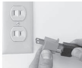
Fig. 6-2 Incorrect