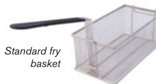
Standard fry basket

Gas fryer has stainless steel front plate and frame, with cool-to-touch front edge. Unit comes standard with steel fry pot, drain valve and extension pipe. Fryer has high performance burners, 2 totaling 26,500 BTUs, or 4 totaling 53,000 BTUs, with Robert Shaw™ snap action thermostat, and high limit thermostat protection. Unit has easy-to-remove oil pan, flue deflector and build-in nesting grooves for hanging fry baskets. Fryers ship natural gas or LP, and are listed to NSF Standard 4 by ETL. 2 year parts and labor warranty.