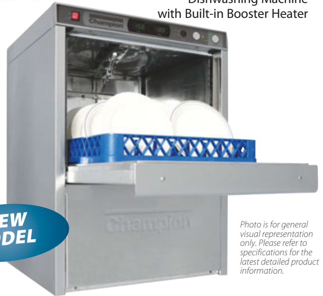
Photo is for general visual representation only. Please refer to specifications for the latest detailed product information.

Undercounter High Temperature Dishwashing Machine with Built-in Booster Heater