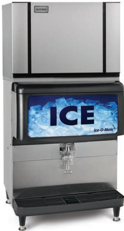
ICEO400 ON CIMO430