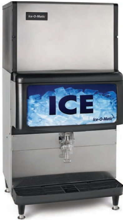
ICEO400 ON IOD250