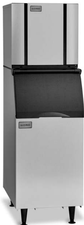
CIMO320 ON B42