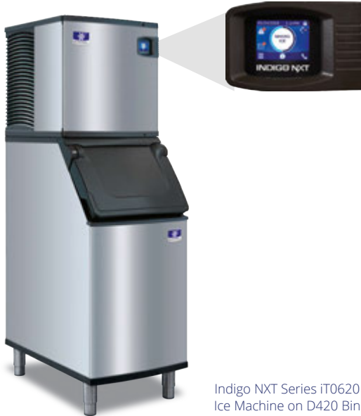
Indigo NXT Series iT0620 Ice Machine on D420 Bin

Designed for operators who know that ice is critical to their business, the Indigo NXT Series ice machine's preventative diagnostics continually monitor itself for reliable ice production. Improvements in cleanability and programmability make your ice machine easy to own and less expensive to operate.