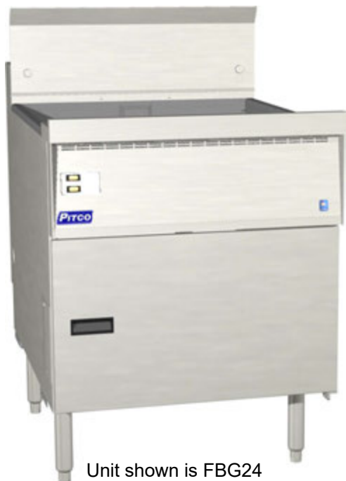
Unit shown is FBG24