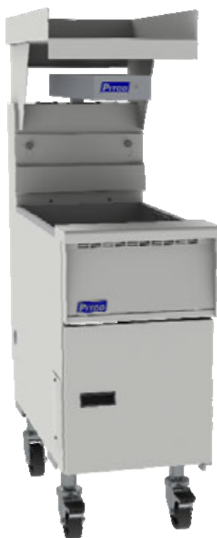
SGBNB18 with optional food warmer, top shelf and casters

To be used with the Solstice Fryer line. Unit can be installed on either side or between fryer(s). Design to match existing or accompanying fryers. Pan area allows for holding and draining of finished product. Drain screen easily lifts out for cleaning. Bottom Shelf provides ample storage for breadings, batter, food utensils, etc. *Bottom Shelf is not provided when a filter pump or flush hose is located inside the dump station.