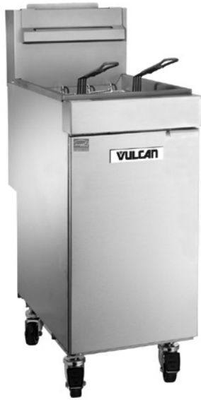
Model 1VEG35M Shown with caster accessories