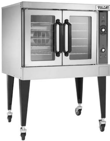
Model VC6ED Shown with optional casters