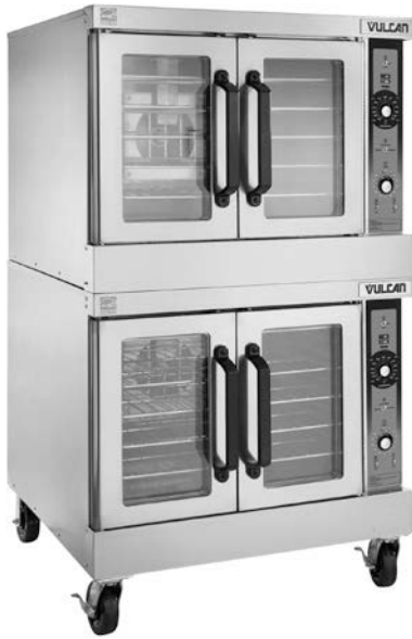
Model SG44 shown with optional casters