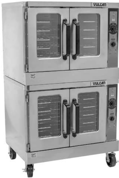
Model VC55GD Shown with optional casters