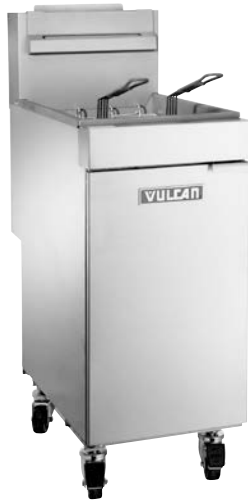
Model LG300 Shown with caster accessories