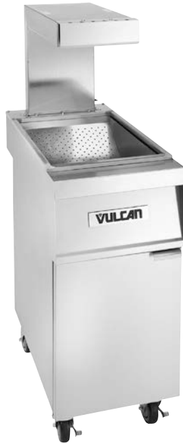
Frymate VX15 shown with optional ThermoGlo™ Food Warmer