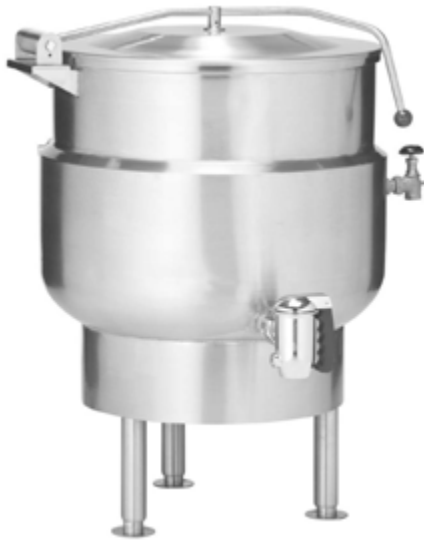
Model K20DL shown with optional 2" plug valve