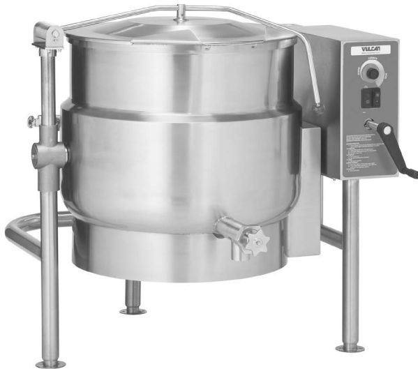
Model K40ELT (Shown with optional draw-off valve)